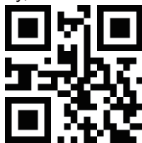
Duration in Scanning(Default: 3.0 sec.)

To set a duration in scanning, scan the bar code below. Next scan three Numeric Bar Codes in appendix that correspond to the desired on time. Single digit numbers must have a leading zero. For example, to set an on time of 0.5 seconds, scan the bar code below, then scan the "0", "0" and "5" bar codes; to set an on time of 10.5 seconds, scan the bar code below, then scan the "1", "0" and "5" bar codes. To change the selection or cancel an incorrect entry, scan Cancel in appendix.